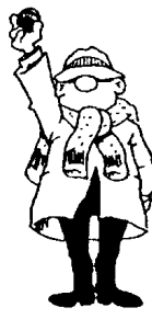
New ball Signalled when the ball is dead.