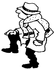
Leg-bye Signalled when the ball is dead.