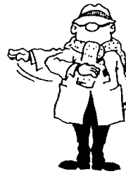
Boundary 4 Signalled when the ball is dead.