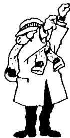
LAST-HOUR Signalled when the ball is dead.