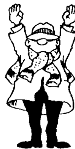
Boundary 6 Signalled when the ball is dead.