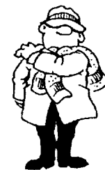
5 Penalty runs to the fielding side. Signalled when the ball is dead.

Umpires signal events in the order they occurred – Penalty runs signal precede all others