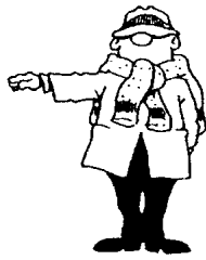
NO-BALL Signalled when the ball is in play.