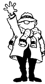
5 runs Signalled when the ball is dead. Not penalties.