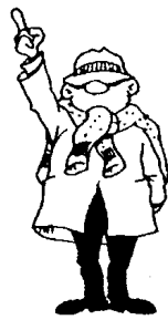
* Out * Signalled when the ball is in play or dead.