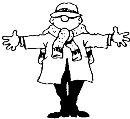
WIDE Signalled when the ball is in play or dead.