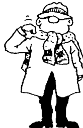
SHORT-RUN/s Signalled when the ball is dead.