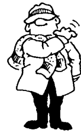
5 Penalty runs to the batting side. Signalled when the ball is dead.