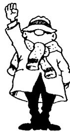
Bye & PLAY Signalled when the ball is dead.