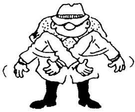
DEAD-BALL Signalled when the ball is in play or dead.